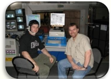
Photo: An APCI Engineer on the set of Mamma Mia in the Moscow theatre.

APCI's StageMaster theatre control system is used throughout the world. As shows move from theatre to theatre APCI are there to give technical assistance the control systems when required.